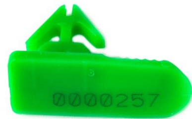
Sequentially Numbered SK1 Plug Seals